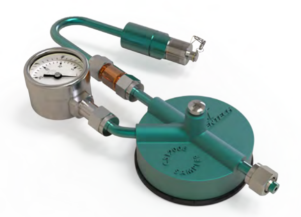
CS1200ES Silonite™ Coated Passive Canister Sampler